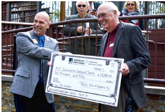
Sacramento Zoological Society was presented $10,000 by Pacific Gas and Electric Company.