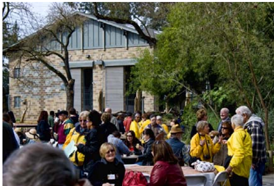
Sacramento Zoological members enjoyed good food during the opening of the habitat.